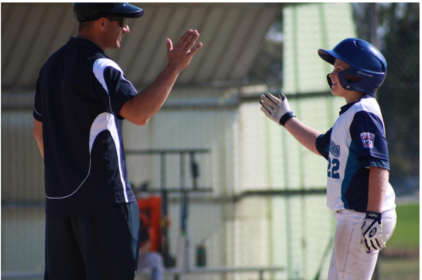
The 2020 Charter Player Development Program will give players the chance to further develop their skills and prepare for promising futures on the field.

Click HERE to read more about the 2020 Charter Player Development Program.