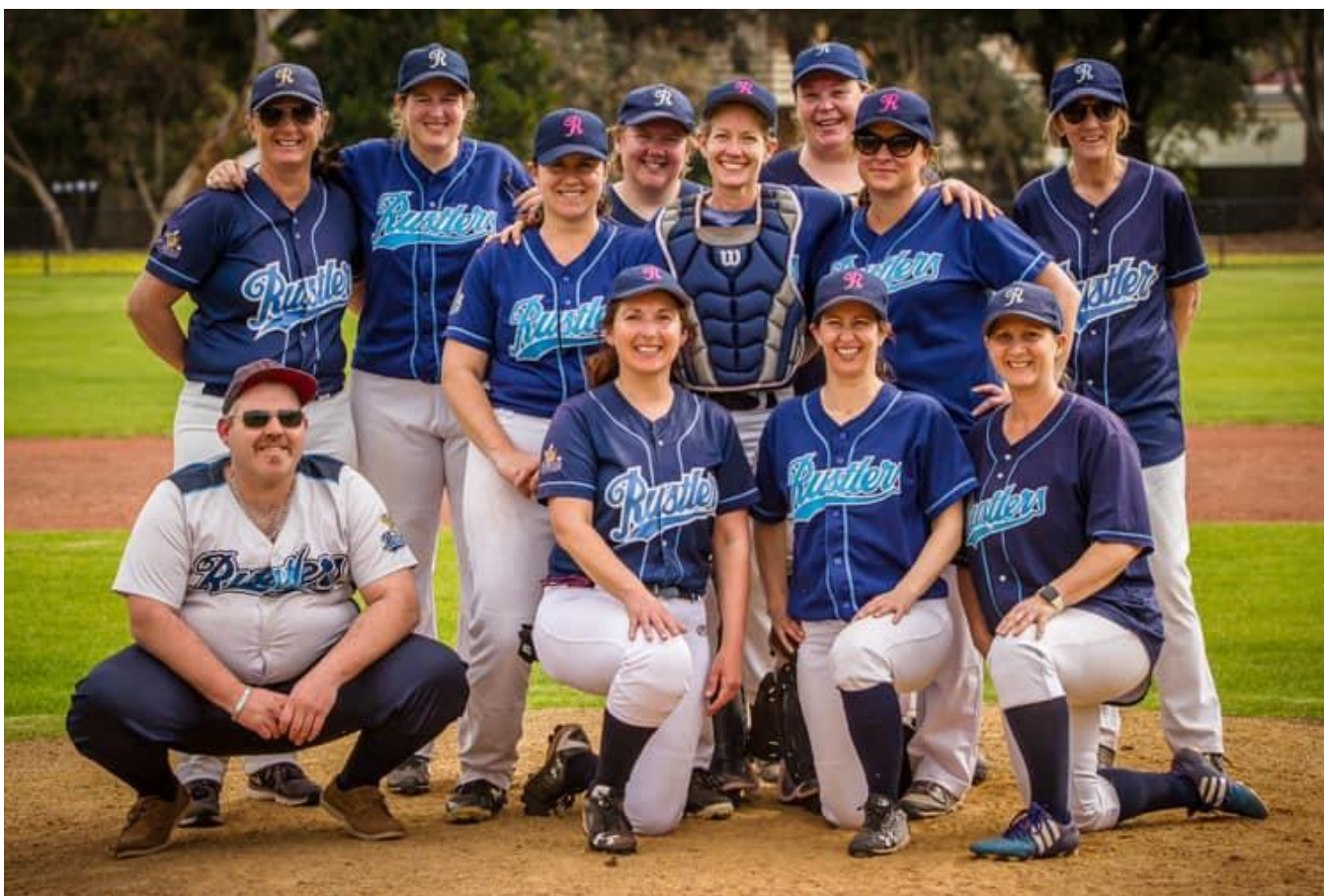
Cheltenham Rustlers Women's Division 3 South team enjoys a 17-7 win over Sandringham Royals in round one of the 2019/20 VSBL season.

We are a few weeks into the 2019/20 VSBL season now, and it has been a wonderful start to the season for our VSBL clubs and teams. It's fantastic to have so many players taking part in more than 40 competitions throughout juniors, seniors and masters, and we look forward to a successful summer of amazing Victorian baseball.