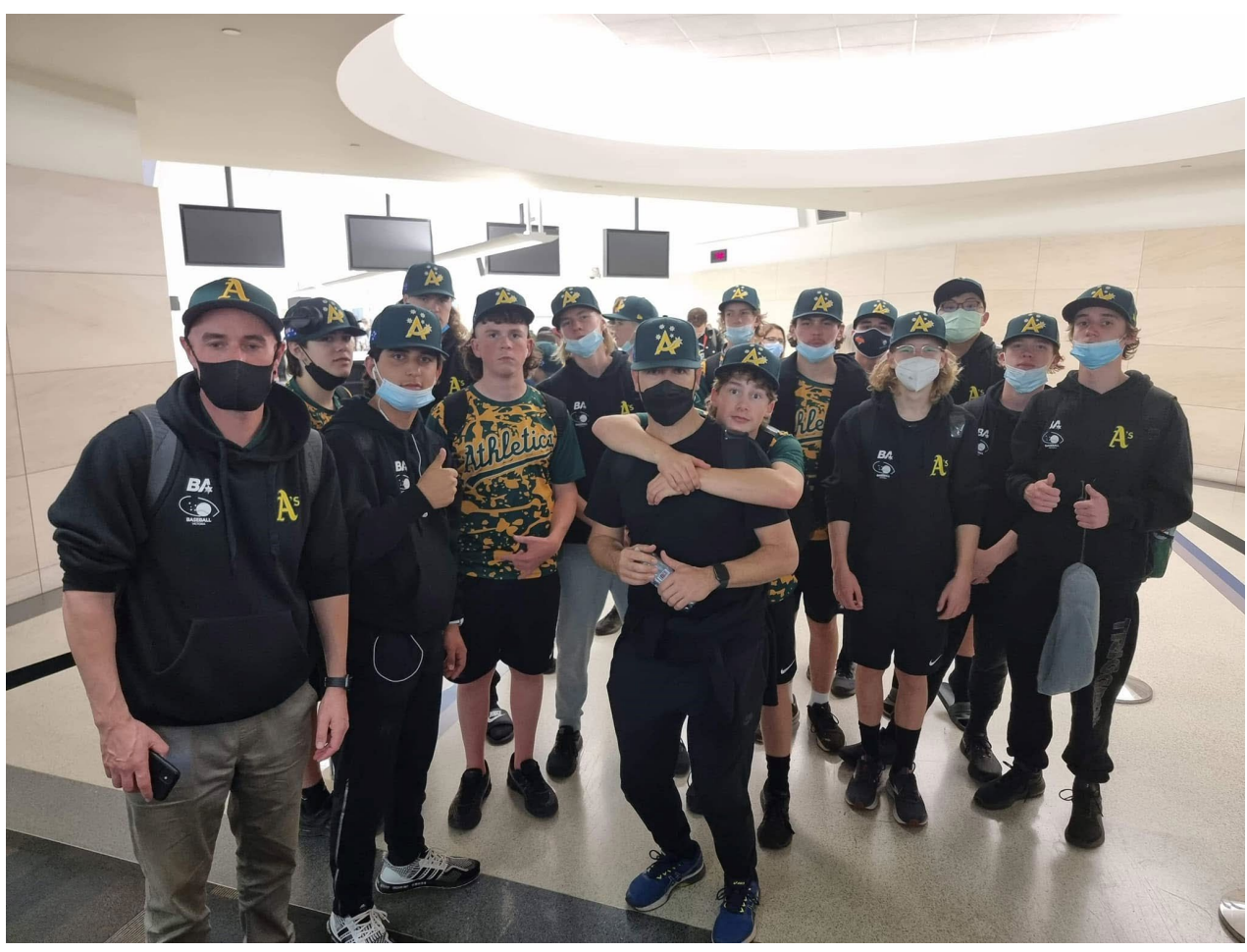
Eastern Athletics travel to the 2022 Senior League Baseball World Series.

Best of luck to the Athletics as they represent Australia - click <u>HERE</u> for the full tournament schedule and stay tuned to the <u>BV Facebook</u> page for updates.