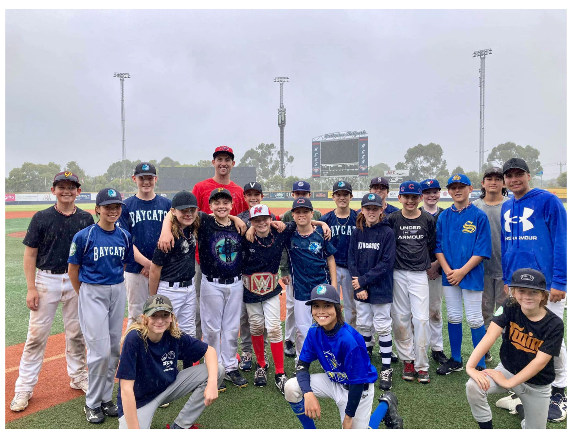
BV School Holiday Camp at Melbourne Ballpark

From skills training to games, these participants worked hard and made the most of the day. We look forward to more fun at future camps!