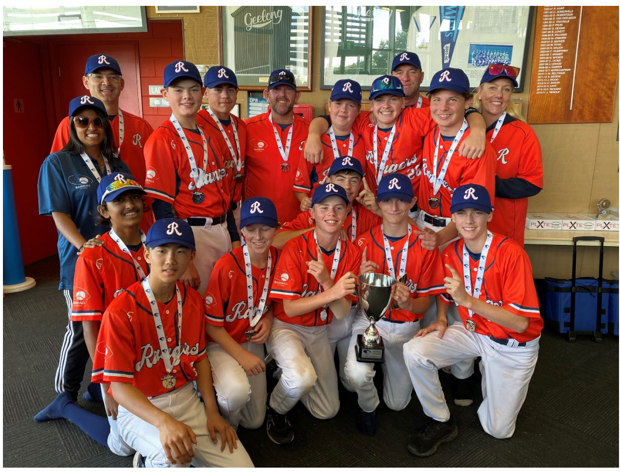
Rangers Junior League