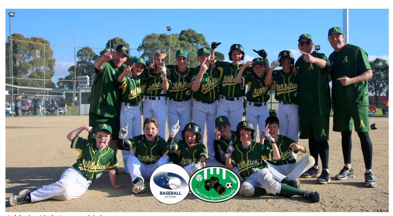
Athletics Little League Major

Stay tuned to our <u>website</u> for the latest updates on the Australian Senior, Junior, Intermediate & Little League Championships next month.