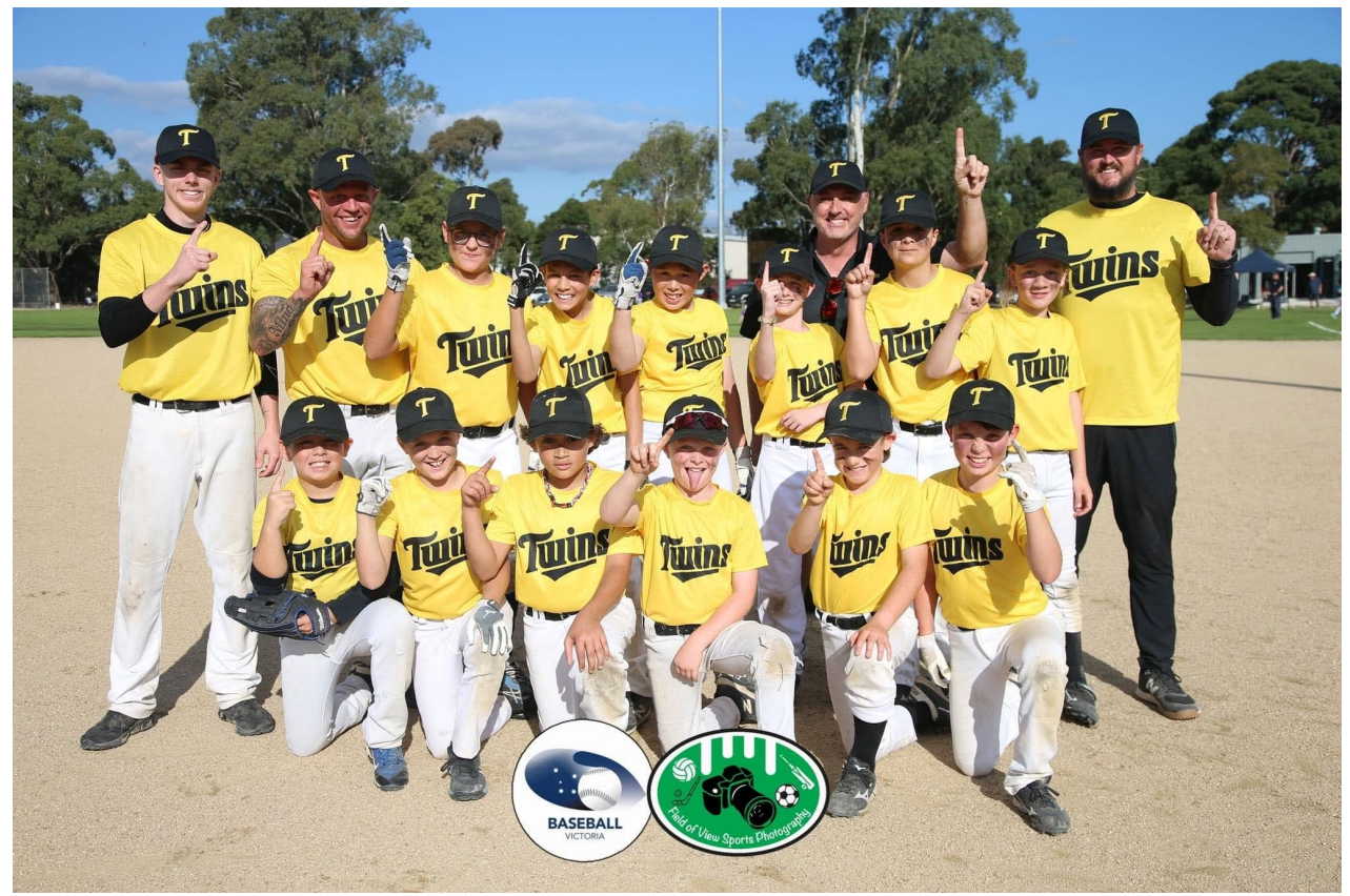
Twins Little League Development