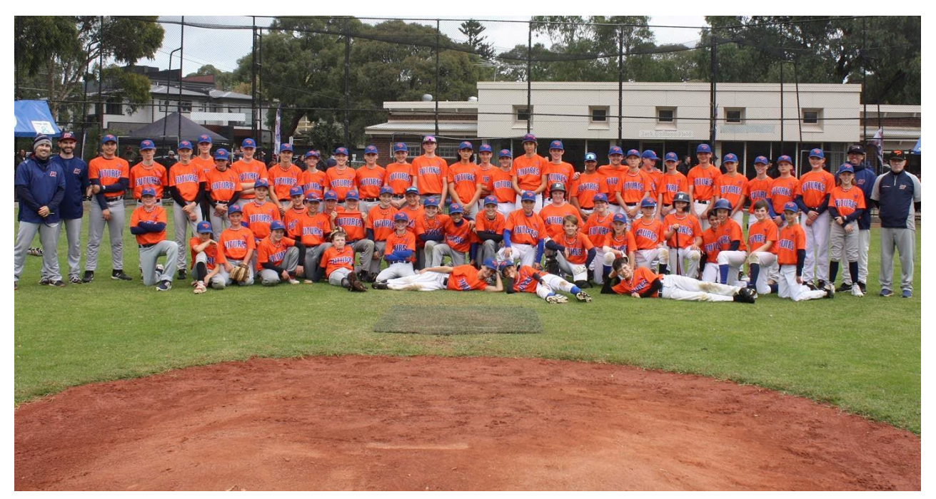
BV Performance Pathway Futures