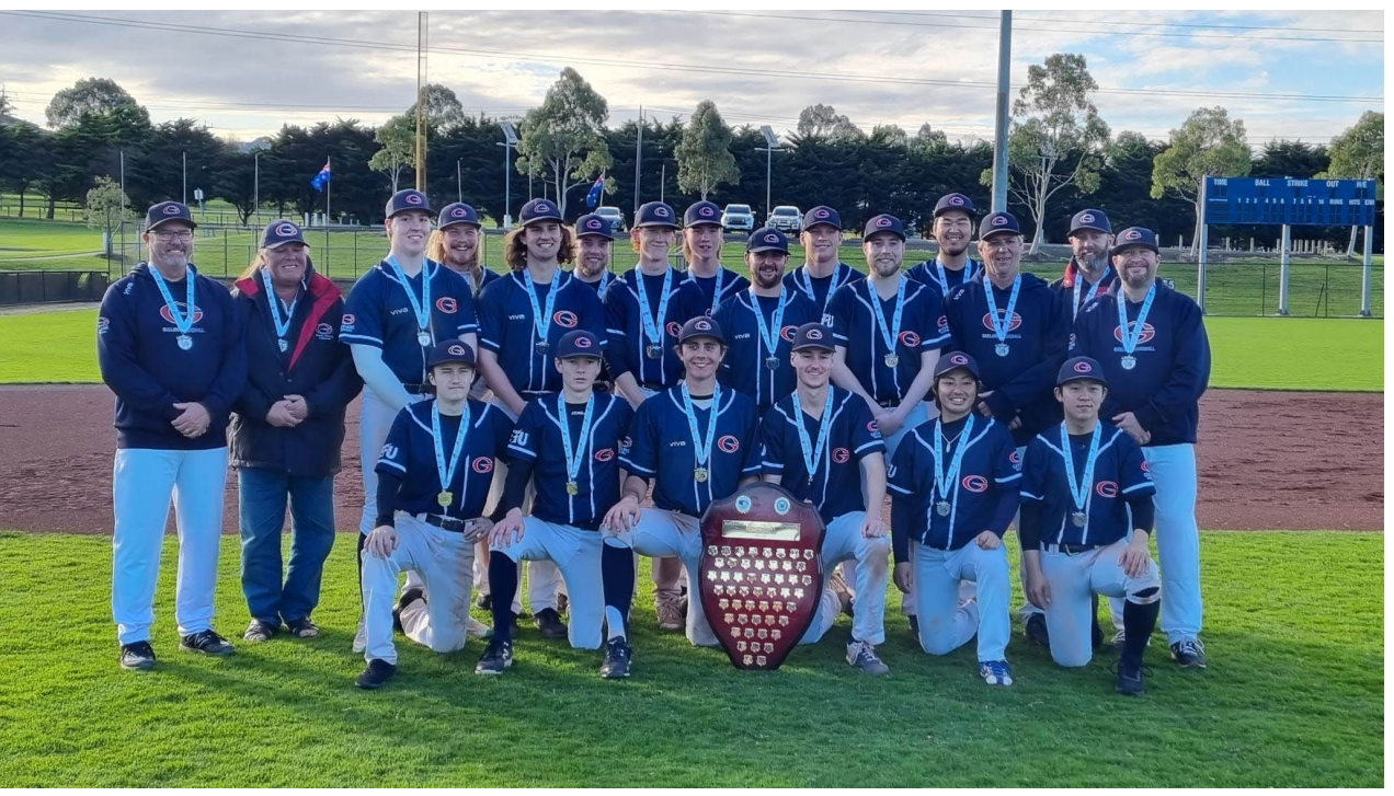
2023 Senior Men's State Winter Champions - Geelong