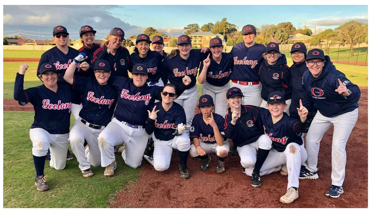
2023 Senior Women's State Winter Champions - Geelong

Next up on our <u>SWC calendar</u> is the U18s from 24-25 June in Wangaratta. Stay tuned for updates.