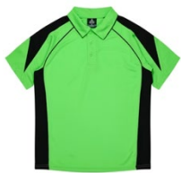
BV Umpire Shirt

*Games include in the above 5-20 are those where the Behind the Mask umpire is listed on and has signed the game sheet as an official record. It is the umpire's responsibility to make sure they are listed on and have signed the game sheet.