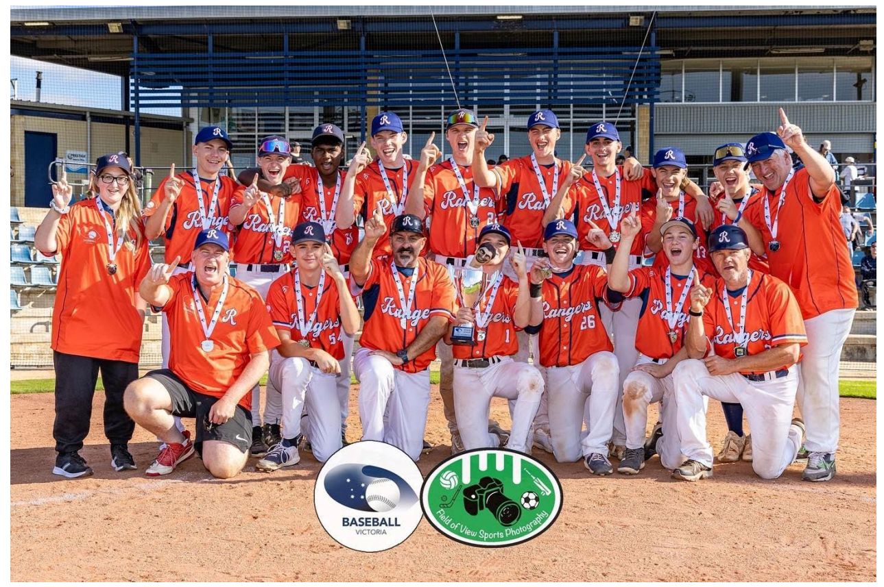
Rangers Senior League