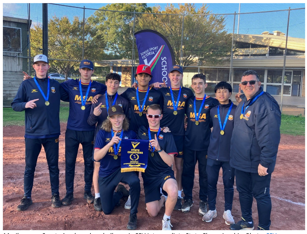
Maribyrnong Sports Academy baseballers win SSV Intermediate State Championship.

Congratulations to Maribyrnong College on winning the School Sport Victoria Intermediate Baseball State Finals! They edged out Irymple Secondary College by a score of 4-0, with the runners-up traveling a whopping 630km over six hours to compete. Great job to both teams on a fantastic display of baseball!