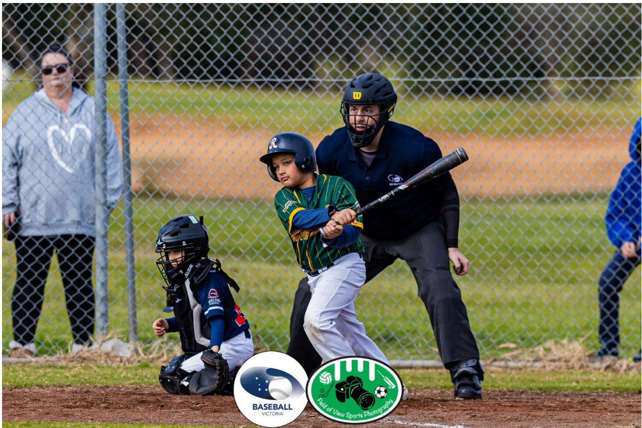
2023 Under 12 State Winter Championships

Stay tuned to BV Facebook , Instagram , and Twitter for updates from the tournament and follow along on GameChanger: Under 12 Division 1 and Under 12 Division 2 .