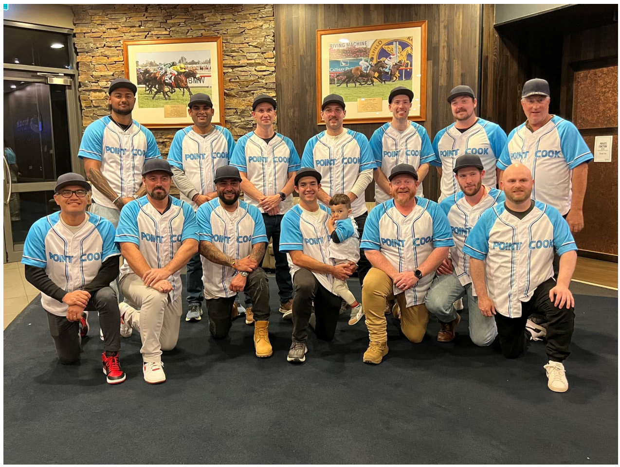
Point Cook inaugural baseball team – winter 2024

The club's first baseball team took to the field in April and has enjoyed a successful inaugural winter season. The club is based at Brookdale Road Reserve and you can learn more/follow along with their journey on <u>Facebook</u>.