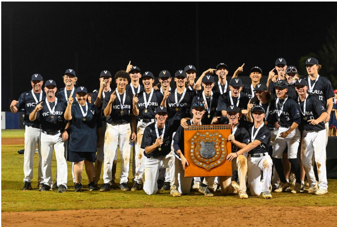
Victoria: 2024 Under 18 National Champions

Click HERE to read more and register for tryouts in September.