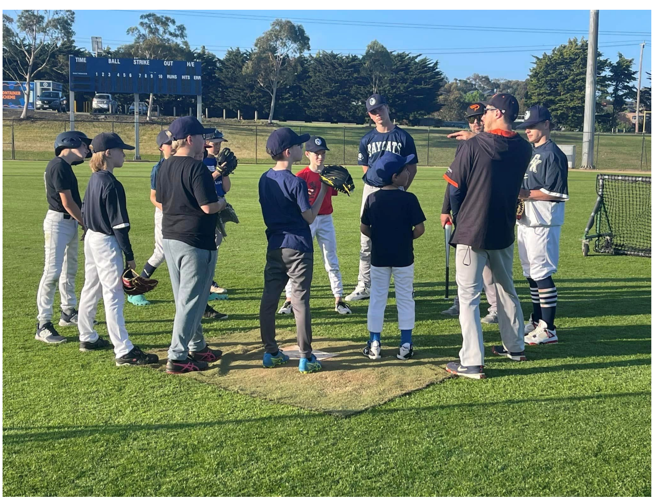
Geelong Baycats – BV Pipeline 2Ball

All sessions are open for all clubs' players and coaches regardless of location. If you have any questions, please email <a href="mailto:development@baseballvictoria.com.au">development@baseballvictoria.com.au</a>.