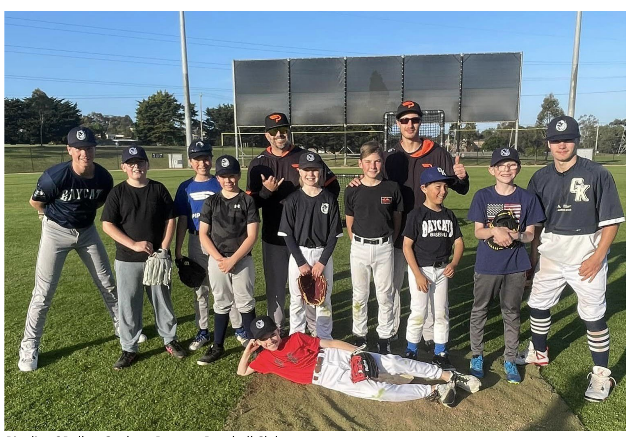
Pipeline 2Ball at Geelong Baycats Baseball Club

All sessions are open for all clubs' players and coaches regardless of location. If you have any questions, please email development@baseballvictoria.com.au.