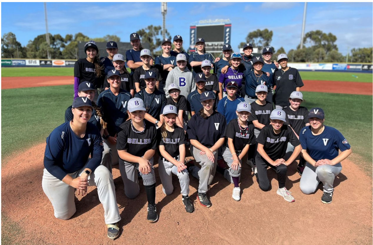
Belles and Victorian Women's State Team