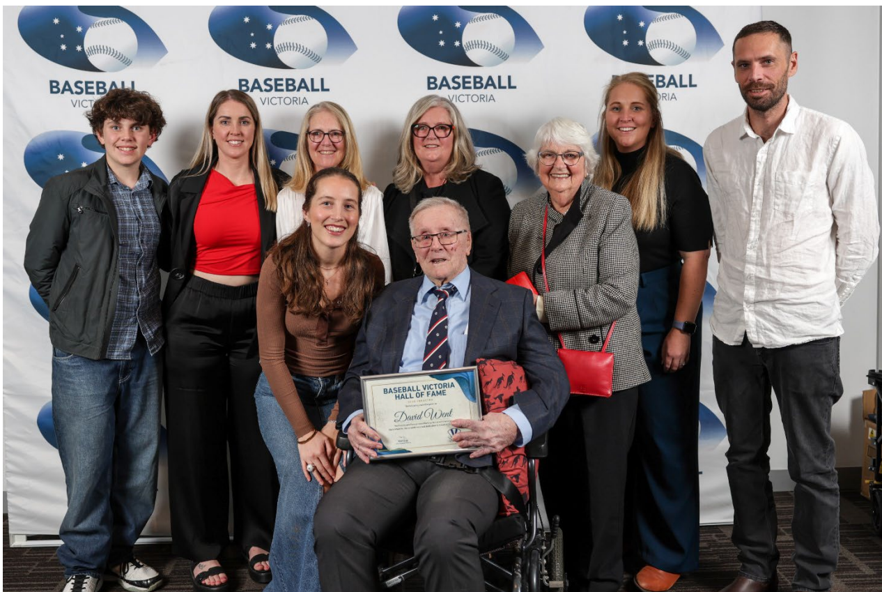
Photo: David Went and family. See all photos from Field of View Sports Photography.