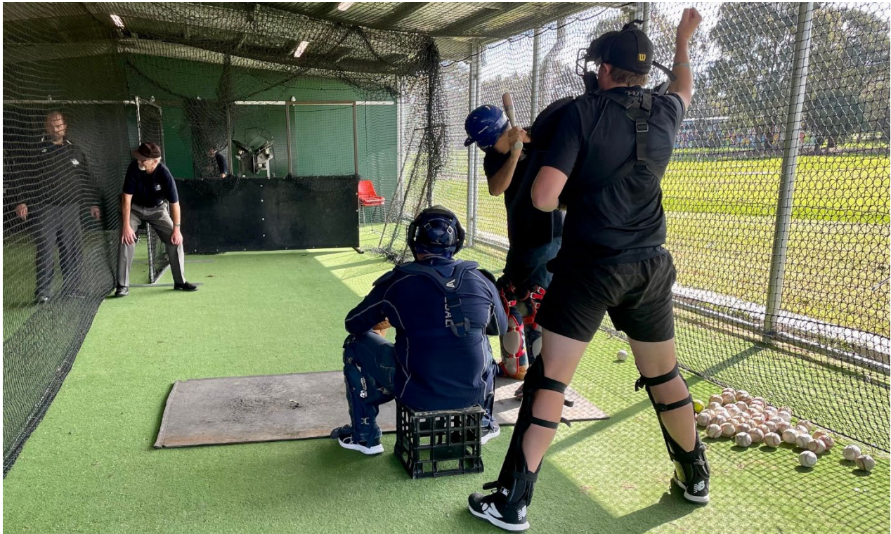
BV Behind The Mask Community Umpiring Training

The BV Umpiring Working Group will hold a Community Umpiring Theory course session on Monday 11 August at North Coburg Baseball Club and online via Zoom from 7-9pm. This will run alongside the regular umpire training session on the same night as a beginner course – the first step toward umpiring certification. Please register HERE so we can plan for numbers.