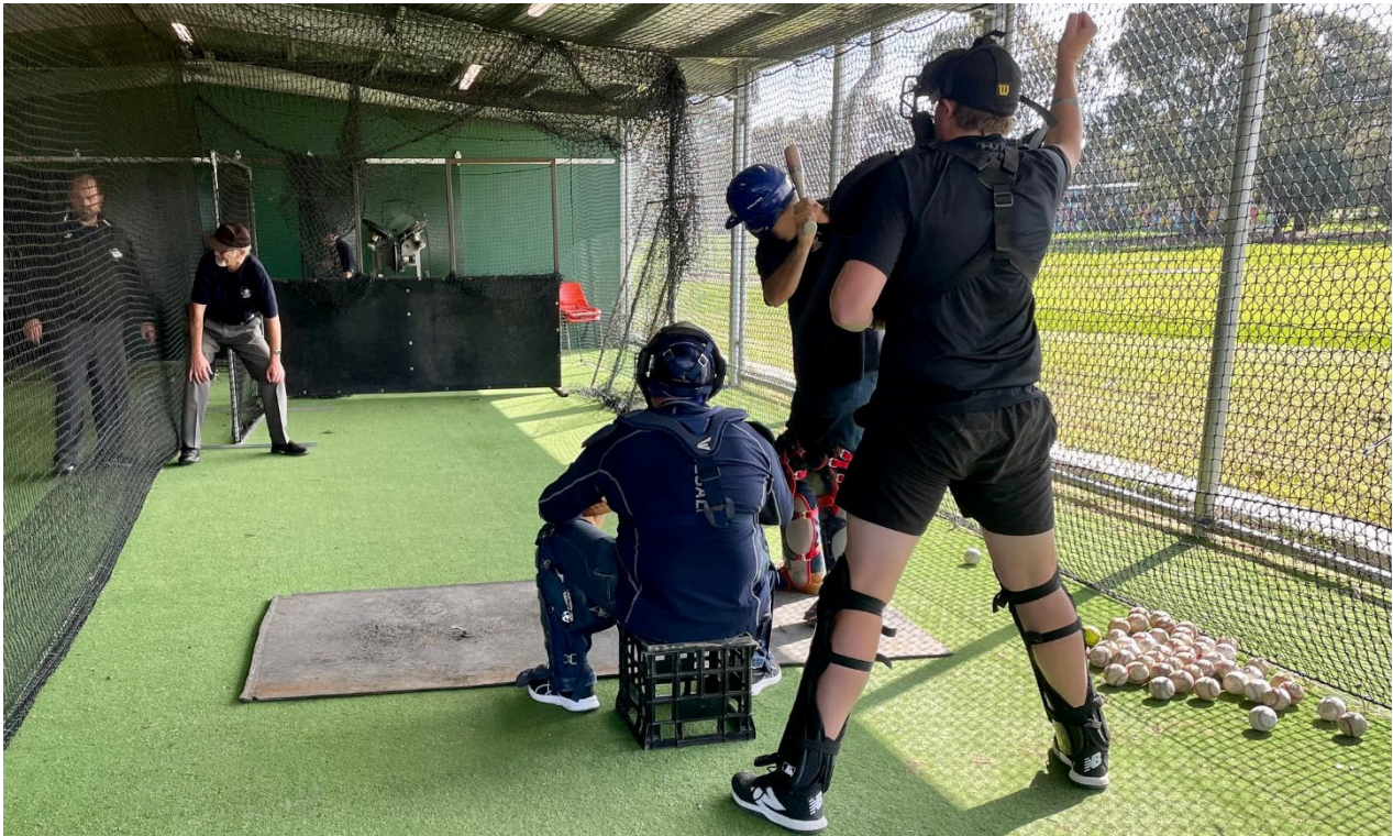
BV Behind The Mask Community Umpiring Training

The BV Umpiring Working Group will hold a Community Umpiring Theory course session on Monday 11 August at North Coburg Baseball Club and online via Zoom from 7-9pm. This will run alongside the regular umpire training session on the same night as a beginner course – the first step toward umpiring certification. Please register HERE so we can plan for numbers.