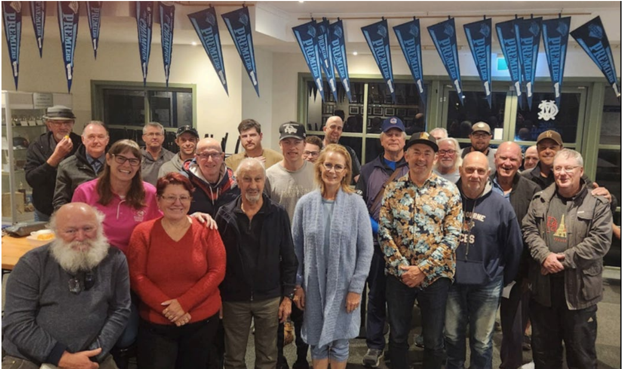
All-umpire meeting at Melbourne Baseball Club

Thank you to all our umpires this summer season – we greatly appreciate your efforts!