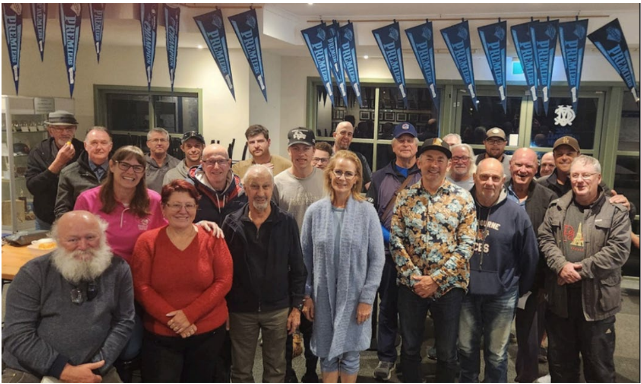
All-umpire meeting at Melbourne Baseball Club