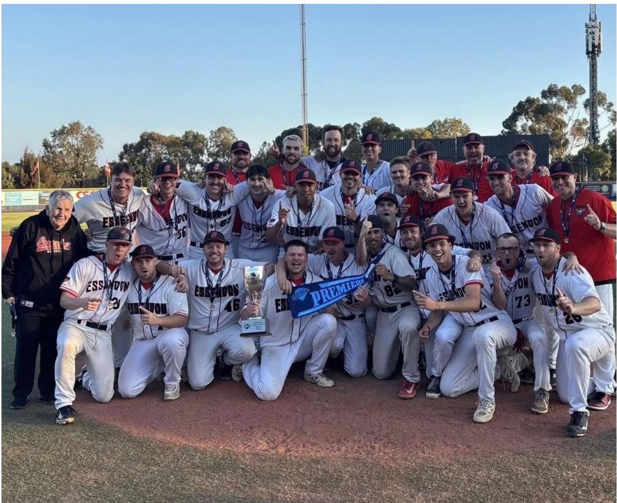
Photo: Essendon Baseball Club – Champions of Premier League 1 Firsts

Check out final VSBL results and follow the VSBL Facebook page for all the updates and wrap-up from the 2025/26 season. Stay tuned for award winners to be announced soon!